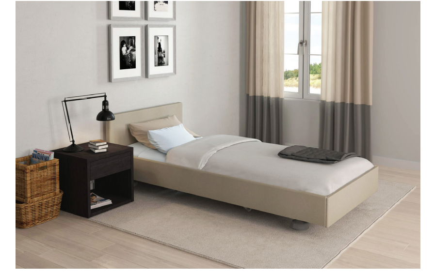
Basso with closed bottom

For more information about the materials, construction and maintenance: please consult our material lists.